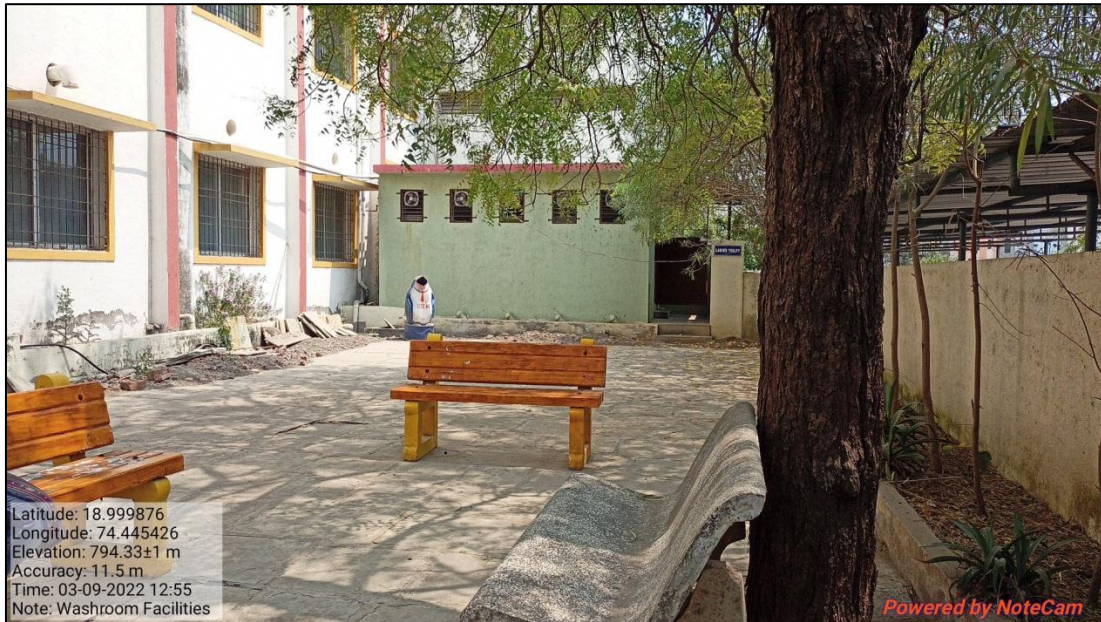
Figure 15: Washroom Facilities for Ladies (Behind the Science Building)