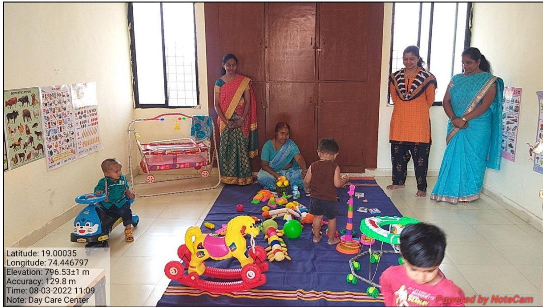
Figure 13: Day Care Center