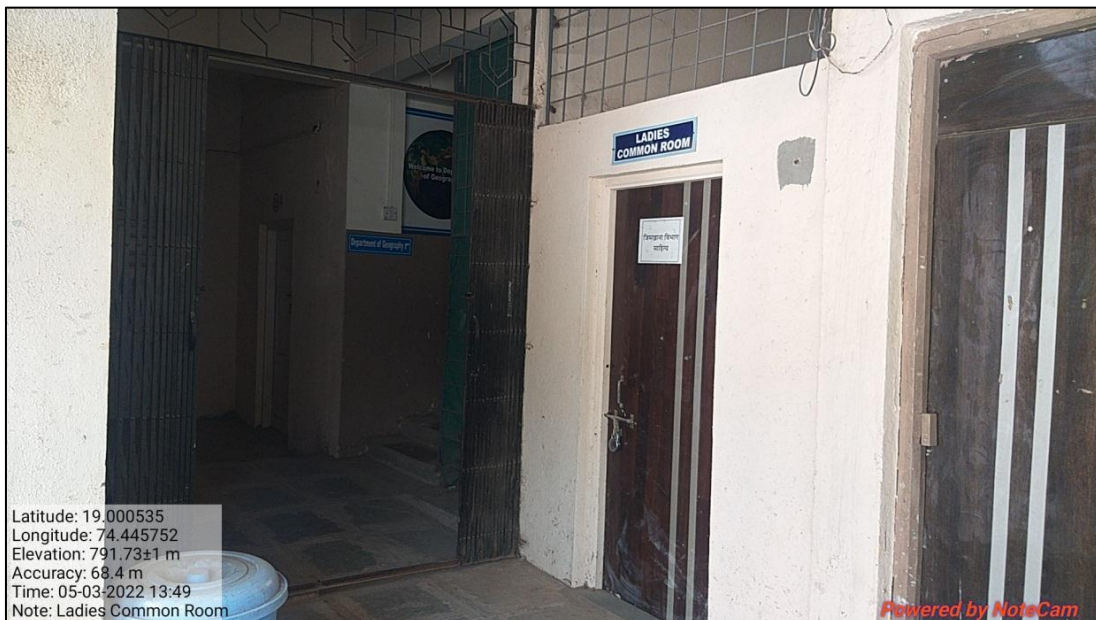
Figure 10: Ladies Common Room