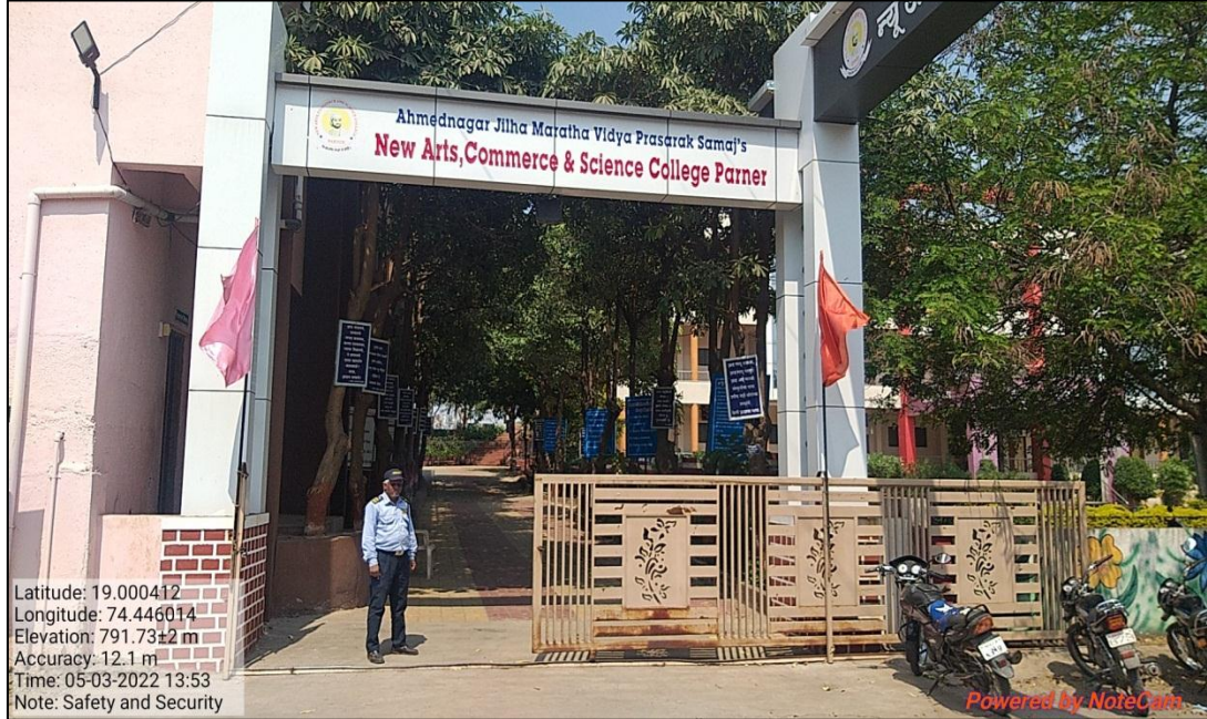
Figure 3: Security Guard at College Entrance