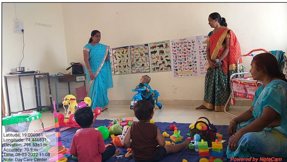
Figure 14: Day Care Center