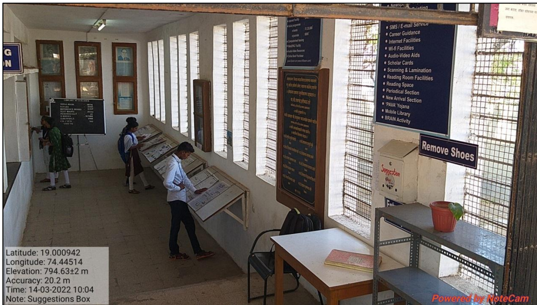
Figure 6: Suggestion Box at Knowledge Resource Center (Library)