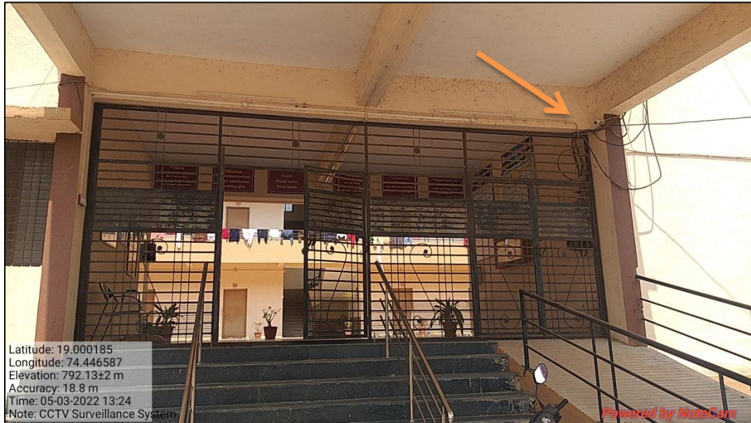
Figure 1: CCTV Surveillance System at Rajmata Jijau Girl's hostel