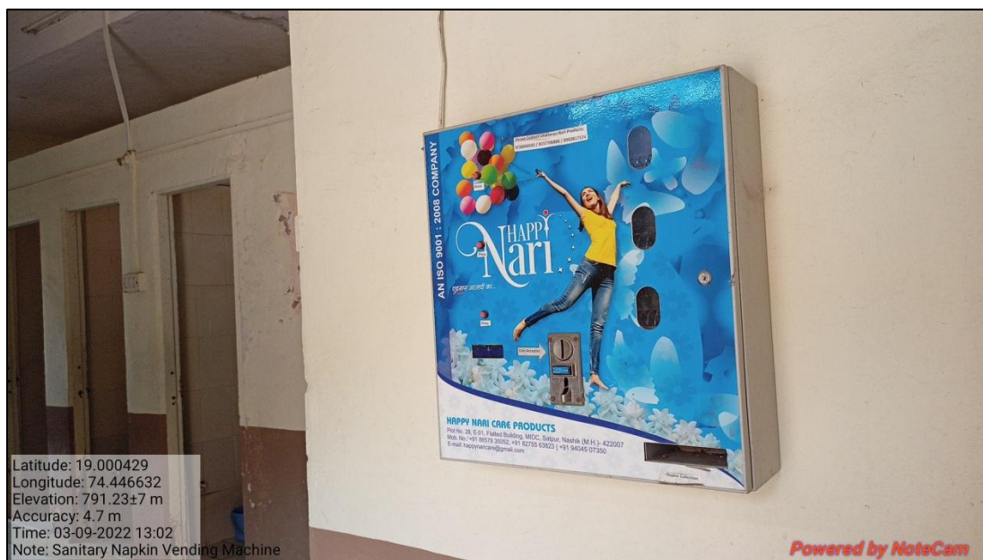
Figure 18: Sanitary Napkin Vending Machine in the Washroom Facility (Girls Hostel)