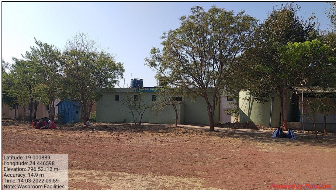
Figure 17: Washroom Facilities for Ladies at Ground