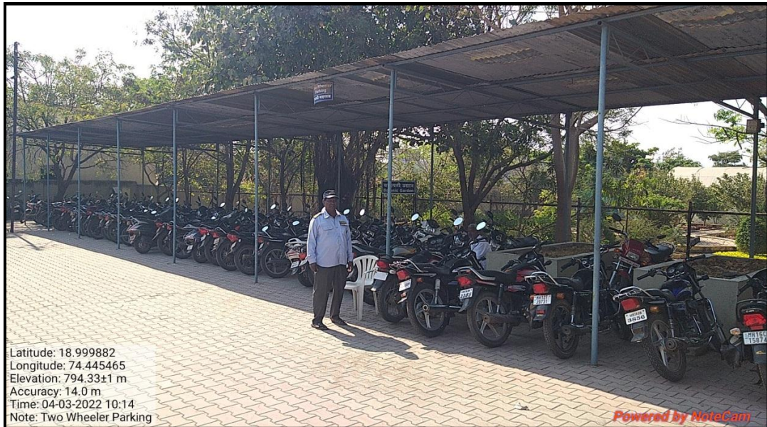
Figure 4: Security Guard at parking area