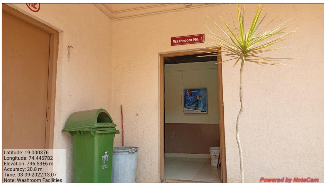
Figure 16: Washroom Facilities for Ladies at Rajmata Jijau Girl's hostel