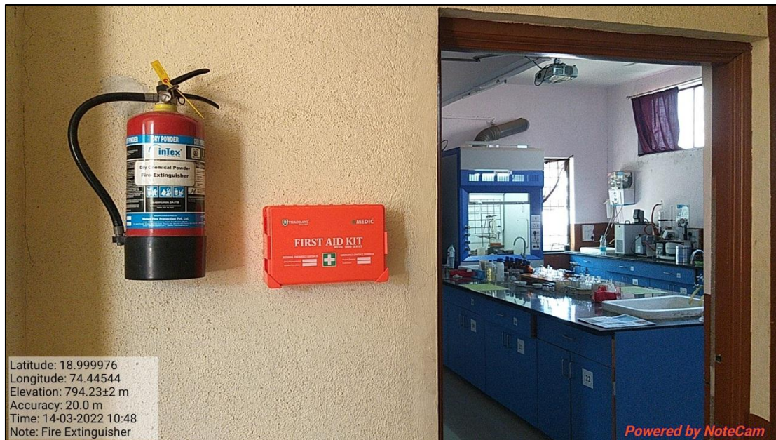
Figure 19 : Laboratory Safety (First Aid Box and Fire Extinguisher)