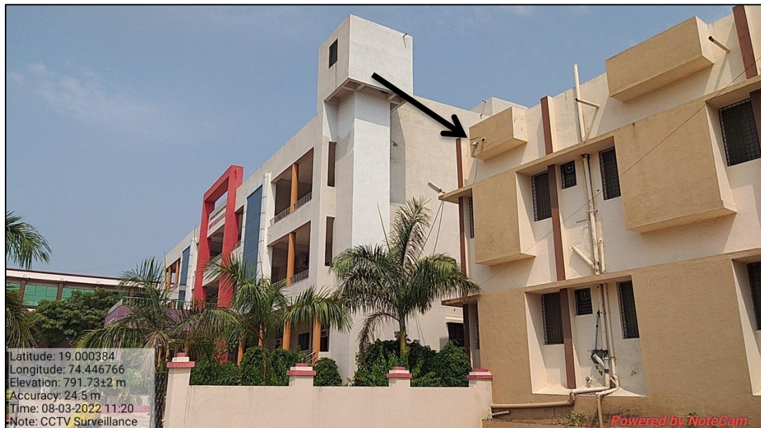
Figure 2: CCTV Surveillance System at Rajmata Jijau Girl's hostel