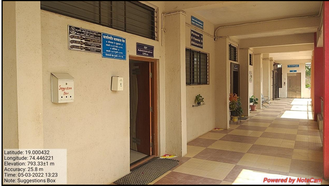
Figure 5: Suggestion Box at Administrative Building