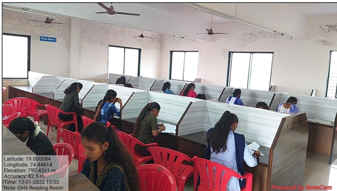
Figure 12: Girl's Reading Room