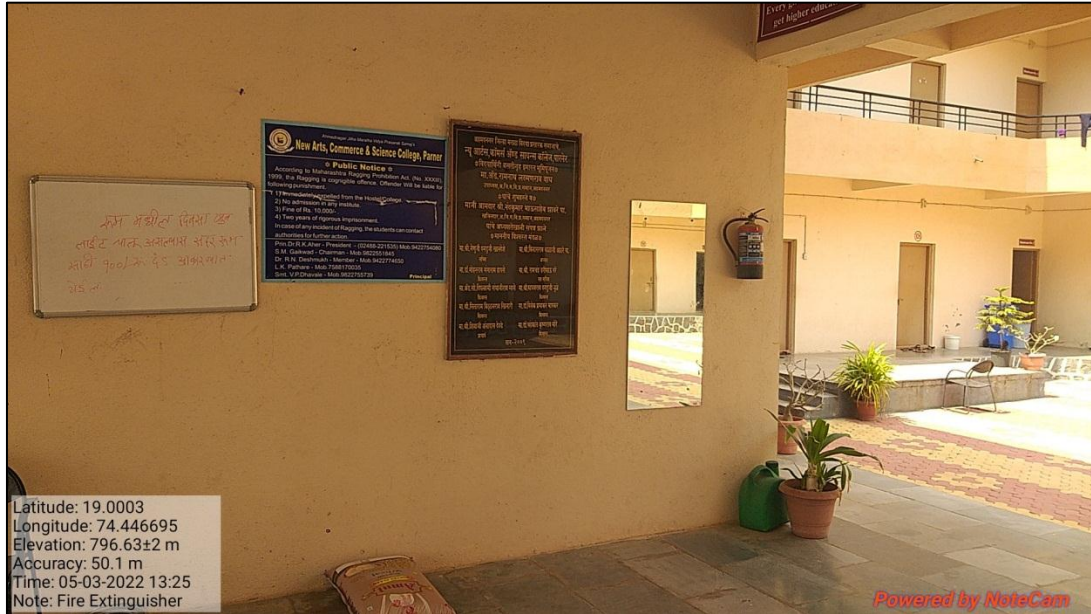
Figure 9: Fire Extinguisher at Rajmata Jijau Girl's hostel