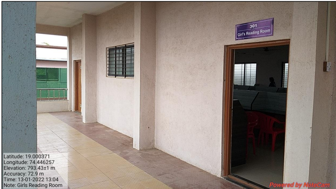
Figure 11: Girl's Reading Room