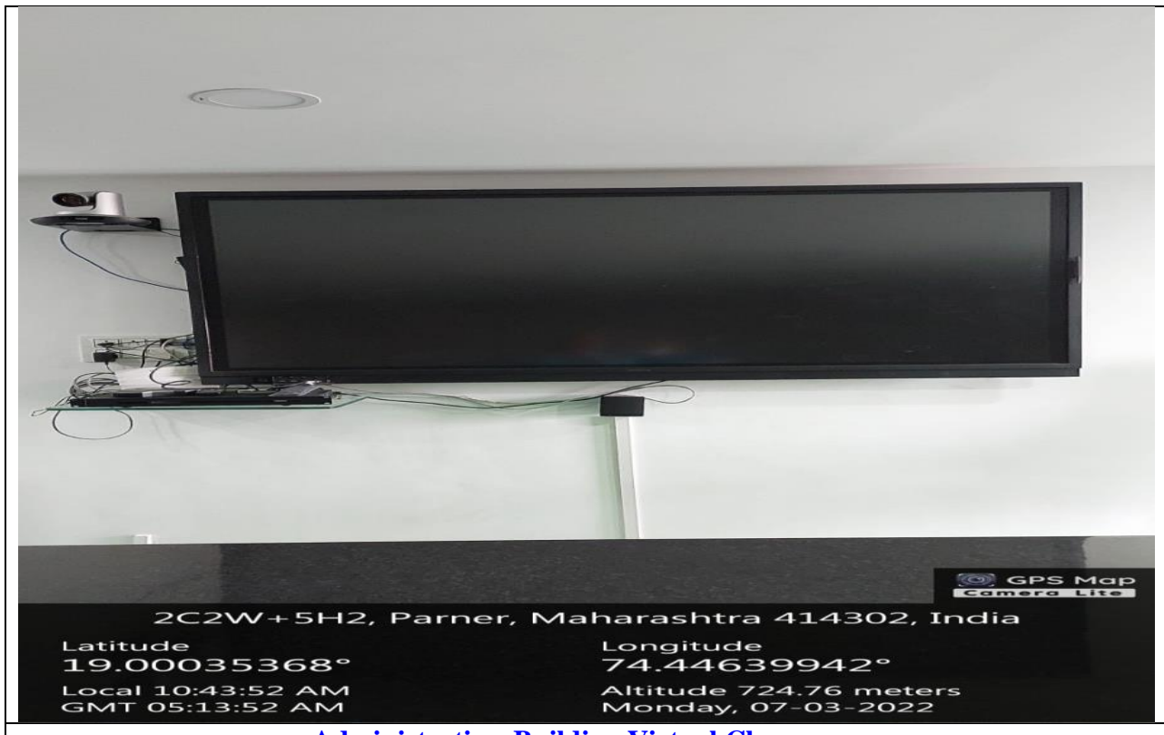
Administrative Building Virtual Classroom