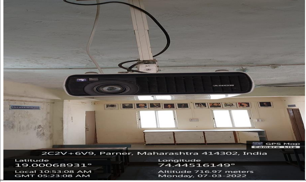
Arts & Com. Building English Department